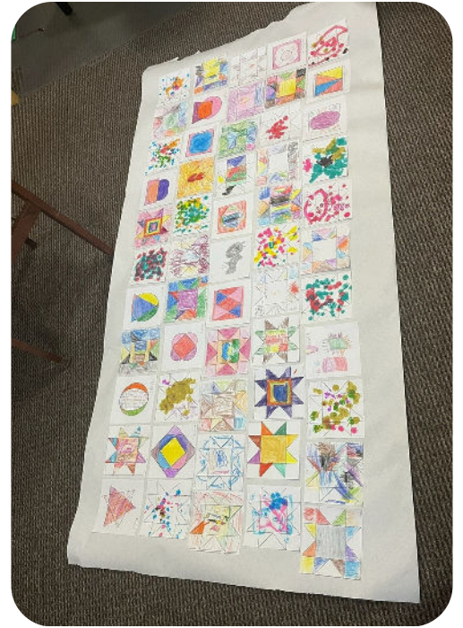
Families created their own quilt squares, which were combined and displayed at the school.

Keep an eye on DIEEC's PLE calendar for this and other future PLEs that focus on diversity, equity and inclusion. We hope you'll join us at one of them!