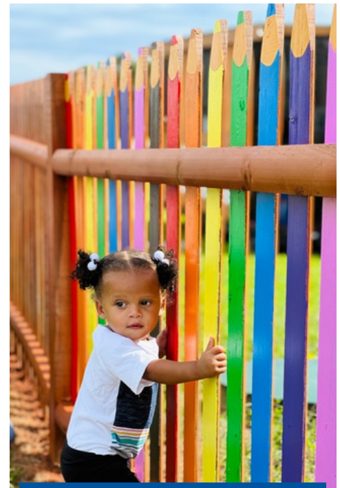
Children learn through exploration.