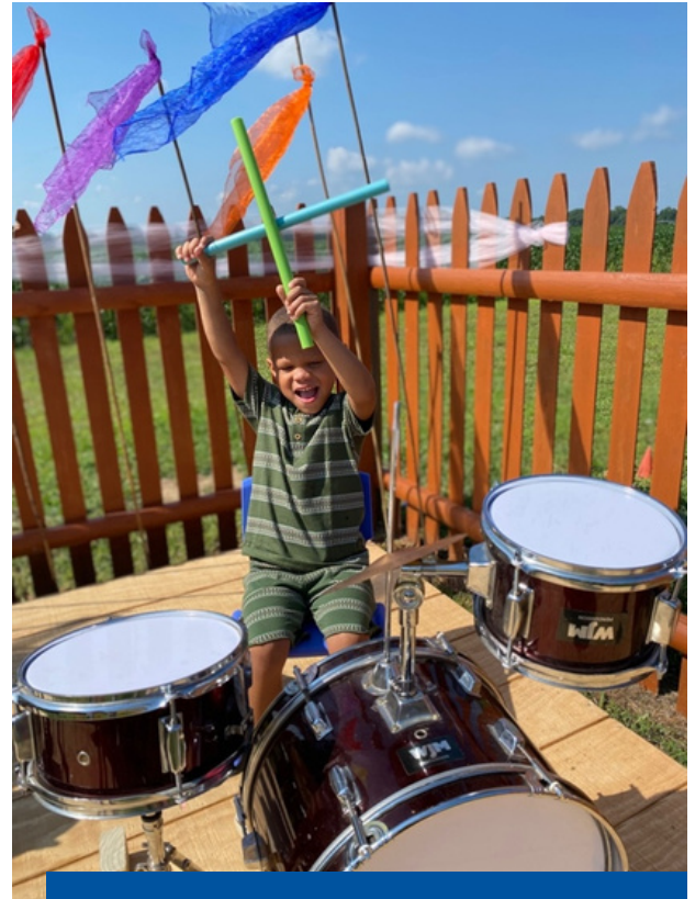
Strike Up the Band! Just in Time's outdoor learning area features a stage with instruments.

"It also helps children with their emotional and social skills. The same children that argue over a toy in the classroom are more willing to dig together and get along."