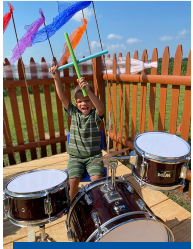
Strike Up the Band! Just in Time's outdoor learning area features a stage with instruments.

"It also helps children with their emotional and social skills. The same children that argue over a toy in the classroom are more willing to dig together and get along."