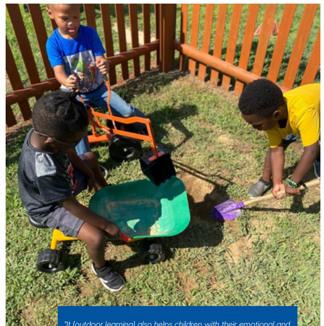
"It (outdoor learning) also helps children with their emotional and social skills. The same children that argue over a toy in the classroom are more willing to dig together and get along."