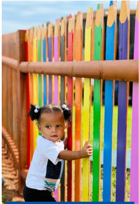
Children learn through exploration.