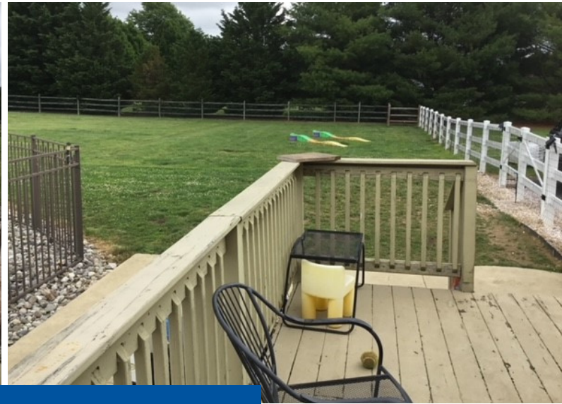
The Kids Zone outdoor classroom was once the large backyard area of Clarise Brooks' home, pictured above.

The families are happy too. So much so that they all contributed to make sure every child had layered rain gear for those bad weather days.