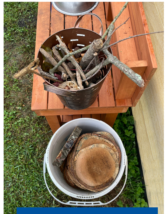
Sticks and stump slices act as loose part items within the mud kitchen.

"An outdoor classroom allows my kids to try different things and become more comfortable with the unknown. This setting promotes hands-on learning and a deeper understanding of how things work."