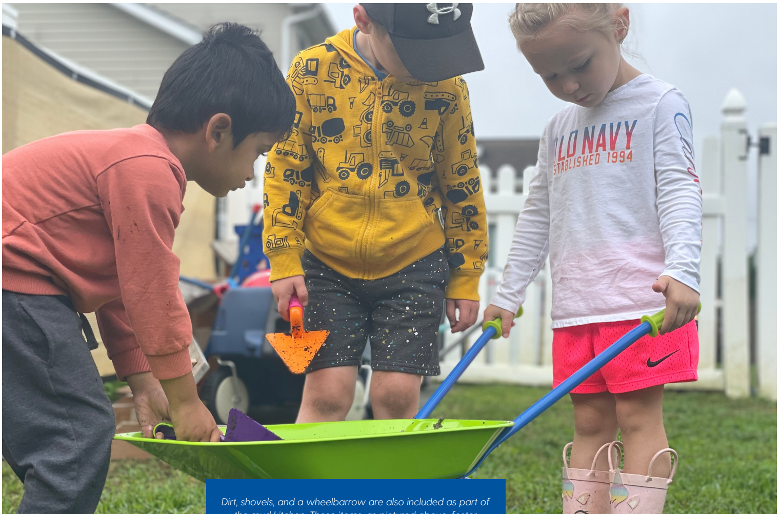
Dirt, shovels, and a wheelbarrow are also included as part of the mud kitchen. These items, as pictured above, foster collaboration among children.