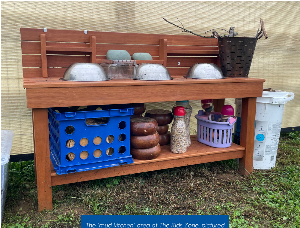
The "mud kitchen" area at The Kids Zone, pictured above, was made possible through Let's Go Outside Grant funds.

"We learn more about nature and then we see it through exploration."