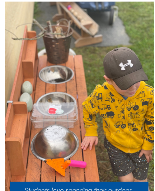
Students love spending their outdoor classroom time exploring the kitchen's various features.

"The kids are much more engaged," adds Clarise. "We learn about nature and then we see it through exploration." She recalls a particular afternoon when they learned about slugs and crickets while holding them.