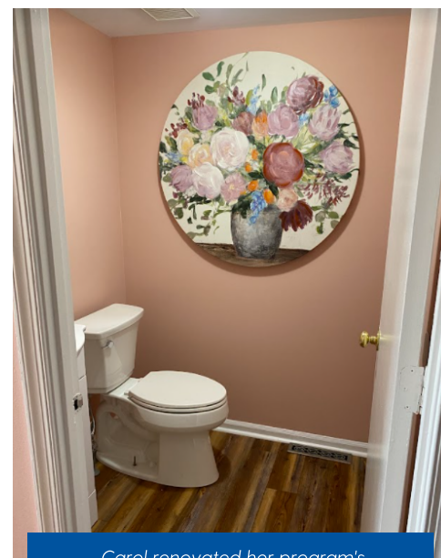
Carol renovated her program's bathroom, and painted all of the walls with washable paint.