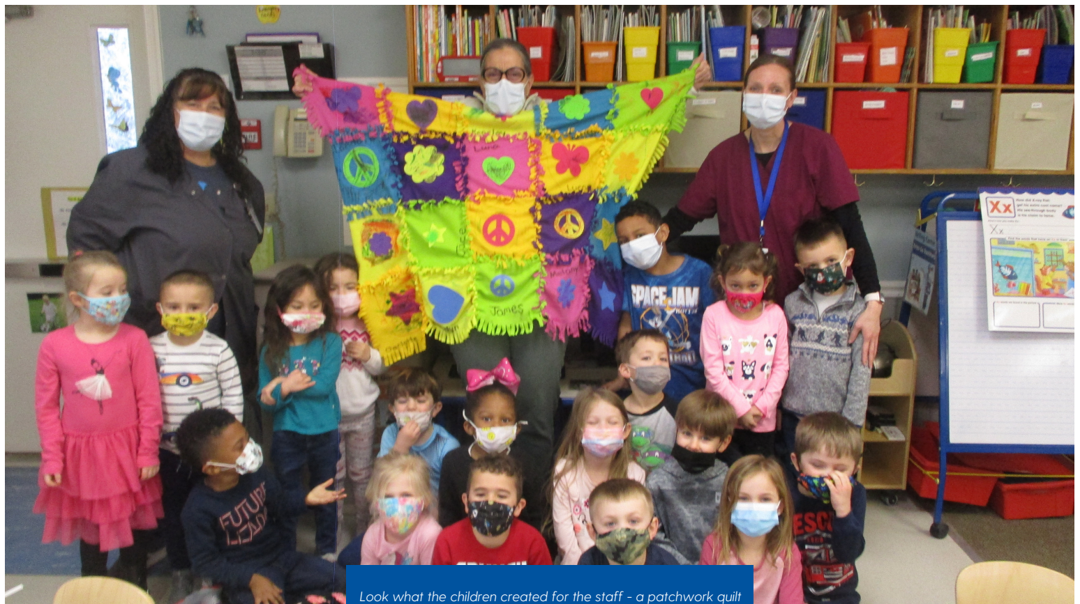
Look what the children created for the staff - a patchwork quilt with individual squares from each child!

"Children just don't deserve the minimum from us or the floor. They need us to break the ceiling - blow it out of the water for them," added Laurie.