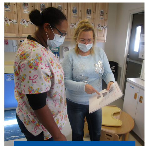
Professional development for staff is a priority at Bayhealth.

The Bayhealth staff also participates in DIEEC's Community of Practice, regularly scheduled meetings for group sharing and support facilitated by a DIEEC Technical Assistant.