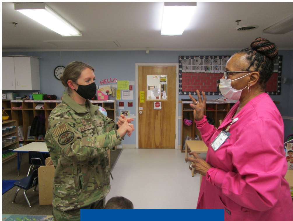
Bayhealth staff engage with families to ensure consistency for the child's best interest.

Another example of exceeding expectations is what Bayhealth does to support positive behavior management through “teasing shields.” Teasing shields are used by the children to encourage positive problem-solving skills.