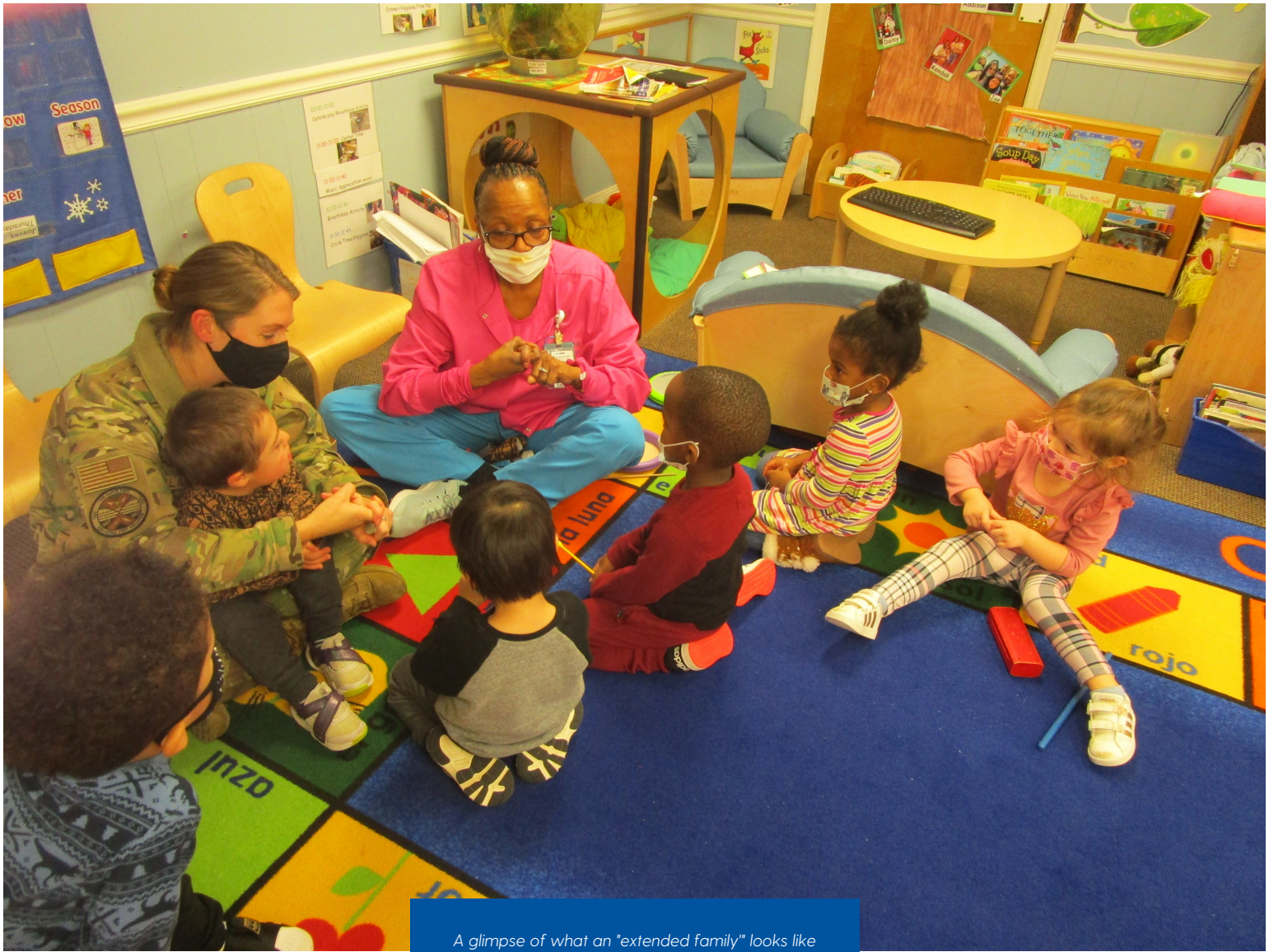
A glimpse of what an "extended family" looks like at Bayhealth Child Care.