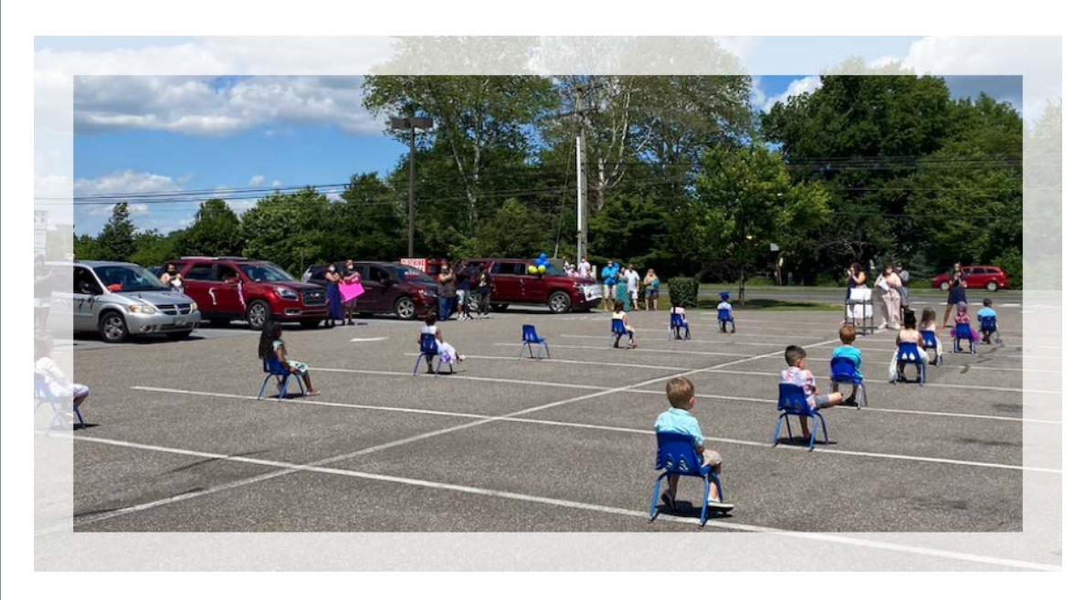
Expanding Our Kids' World Child Care Center celebrated graduation outdoors while practicing social distancing and wearing face coverings.

Early childhood education programs created new ways that were safe for their children and families to celebrate key events like preschool graduation.